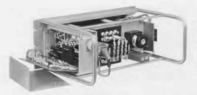
Figure 3. Rear view of a regulator with dust cover removed and etched board swung out for access to components and wiring.

tional to the output voltage deviation and whose phase is determined by the direction of this deviation. A solidstate amplifier converts the small ac error signal into the large ac voltage required by the motor.